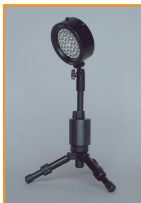
Tabletop Tripod Stand