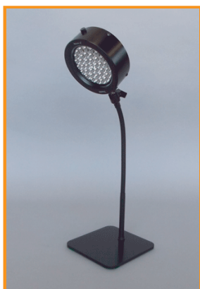
Flexible Tube Stand