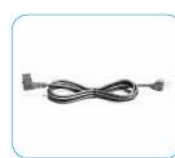
POWER CORD AC100~120V...CP1-100 AC200~240V...CP1-200

(1)Standard input voltage is 200-240V, CP1-200 is included in XELIOS. (2)Color temperature have \pm 10\% margin of error.